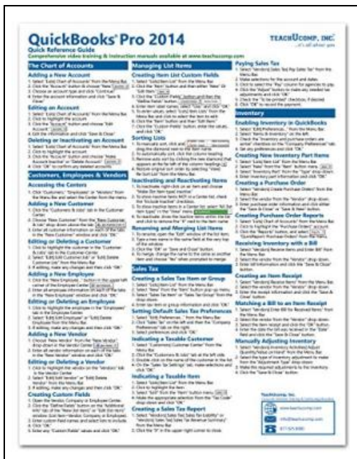
Filesize: 6.06 MB