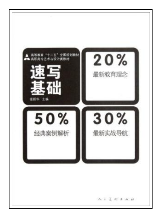
Filesize: 2.77 MB